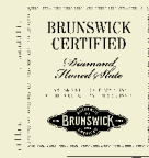
Brunswick Certified Slate