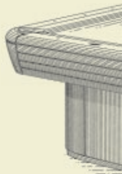
Simple yet glamorous design

The Gibson is a classic blend of design, craftsmanship, and unpretentious elegance. Crafted from exotic Brazilian curubixa and presented in our Original Mahogany™ finish, this simple yet glamorous table features legs with bird's-eye maple inlays and curved aprons